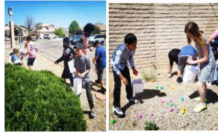
Easter Egg Hunt Rio Vista Church of the Nazarene

Join us for the Rio Vista Church of the Nazarene Children's and Teen Ministries Parking Lot Rummage Sale Fundraiser April 30, 2022 8 am to 2 pm. See you there!